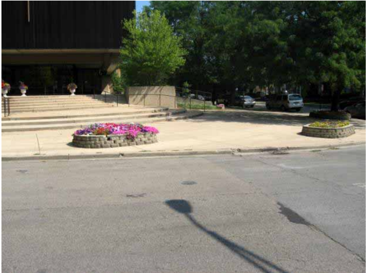
No curbs cuts along the entire south side (entrance) of Lutheran School of Theology