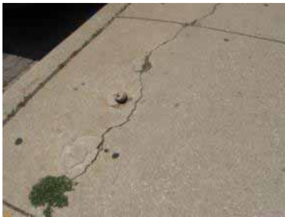
Water, gas caps, parking meter stubs exposed or open, Woodlawn