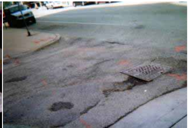
Alley crossing sidewalk near South Shore Drive