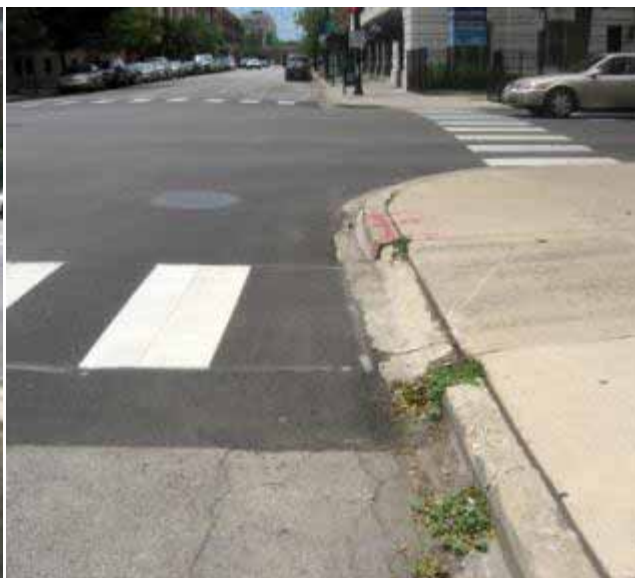
Stepped curb at bus stop, 55th and Hyde Park Blvd, no curb mats or truncated domes