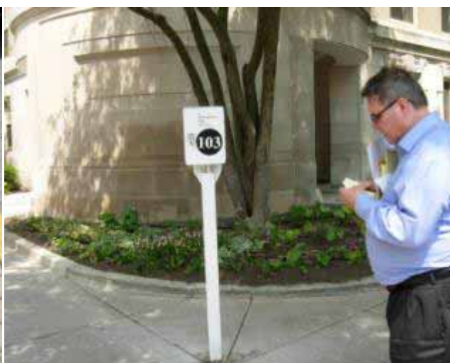
Inappropriate position of safety phone