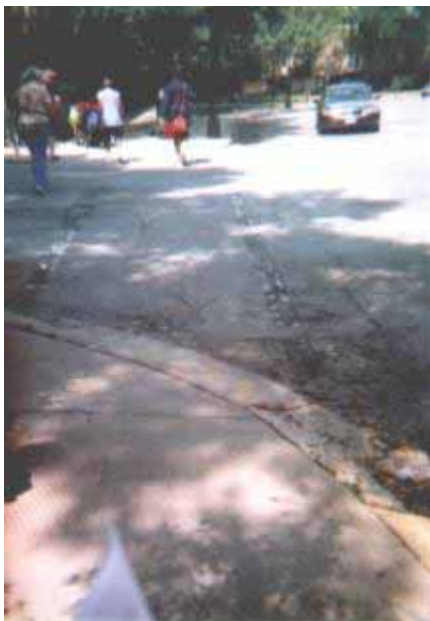
55th and Dorchester, no warning mats, decayed curbs