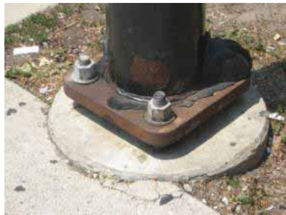
Several light poles with exposed bases between Kenwood and Woodlawn