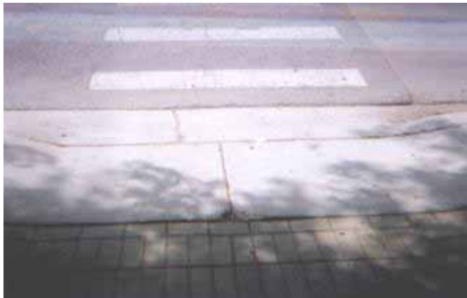
Harper crossing for Hyde Park Shopping Center, no warning mats or bumps