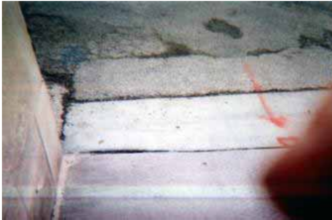
Sidewalk at the viaduct, crossed by alley