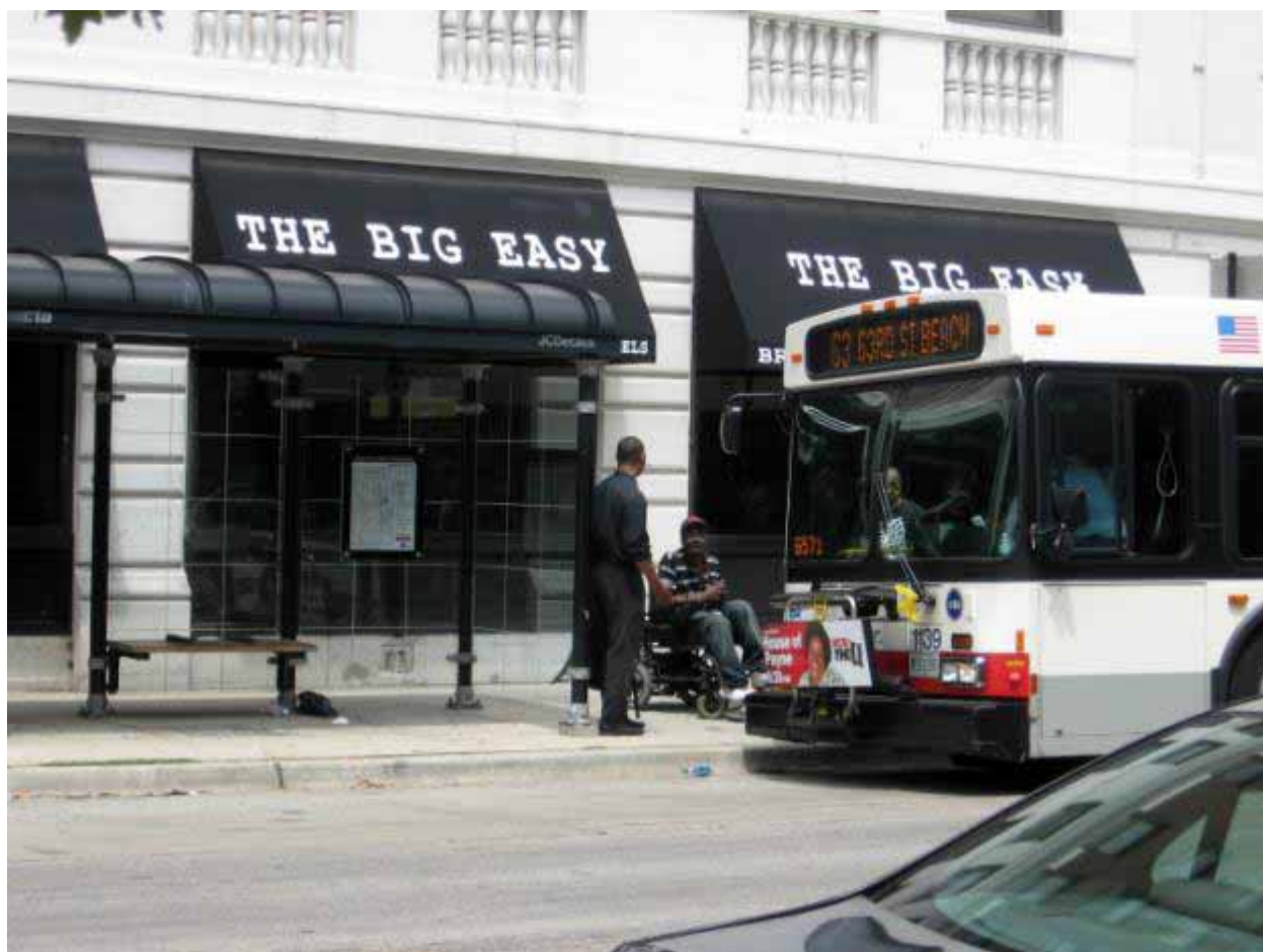
Awkward position of bus shelter at 55th and Lake Park, creates difficulties for persons in wheelchairs to board buses