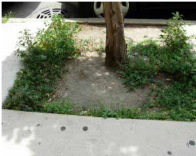
Missing tree grates and uneven surface levels