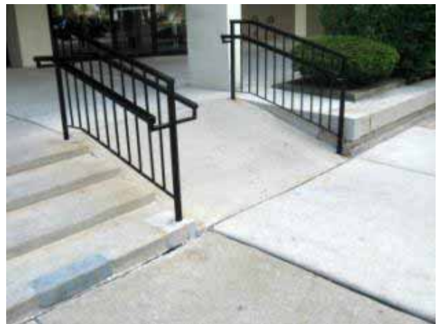
Entrance to University Park, with ramp above curb that is extremely steep