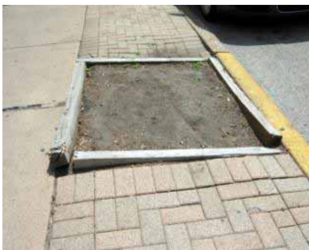
Dangerous landscaping along parkways