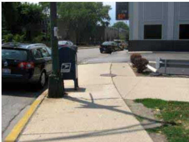
Entrance to BankFinancial drive-thru, with poor slopes and crumbling pavement