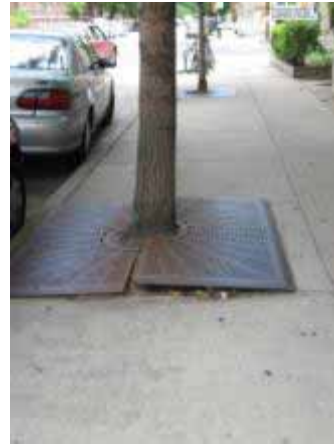
Tree wells at 55th and Cornell