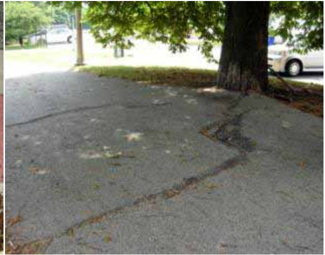
Tree roots create severe crack at entrance to park