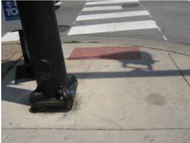
Obstructed and awkward ramp at Starbucks