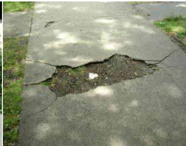
Major sidewalk decay on Cornell