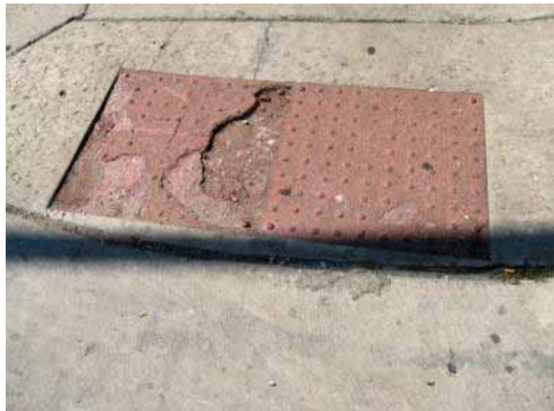
Woodlawn, badly deteriorated warning mats, all 4 corners