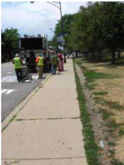
Narrow sidewalk from Dorchester to Kimbark, particularly along Nichols Park