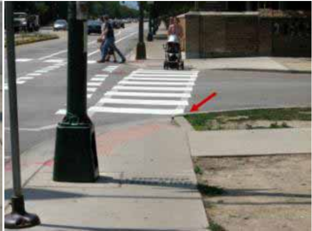
Curbs and mats that don't align with cross walk, Kimbark and again at University