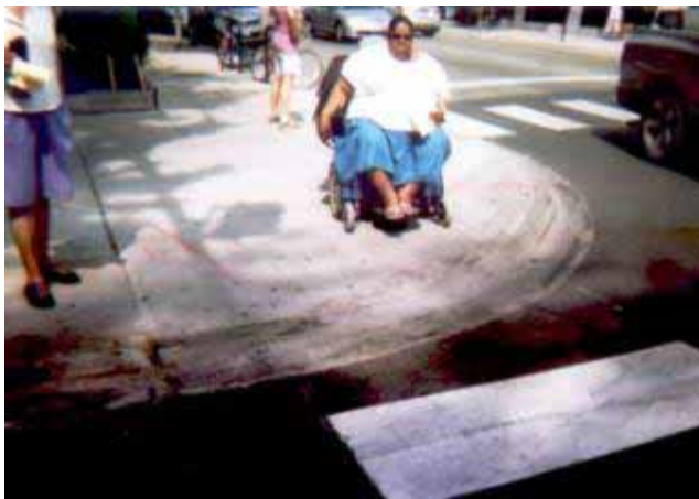
Intersection, 55th and Hyde Park Blvd