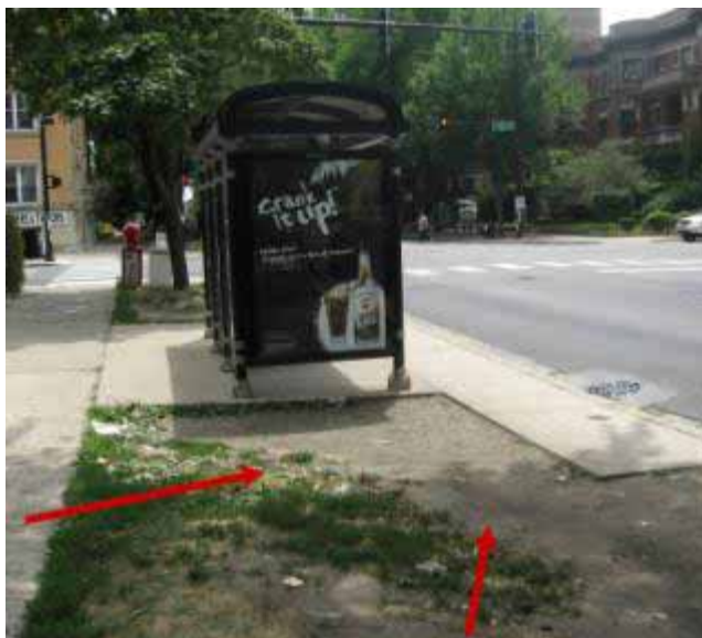
Concrete pad does not extend far enough for wheelchairs to board bus