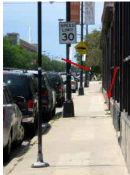
Pipes that extend into the sidewalk, low-hanging trees, Woodlawn to Ellis