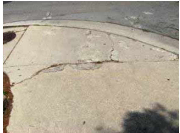
Uneven, ragged, curb at Dorchester, no domes or warning mats