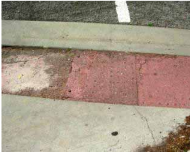
55th and South Shore, deteriorated mats