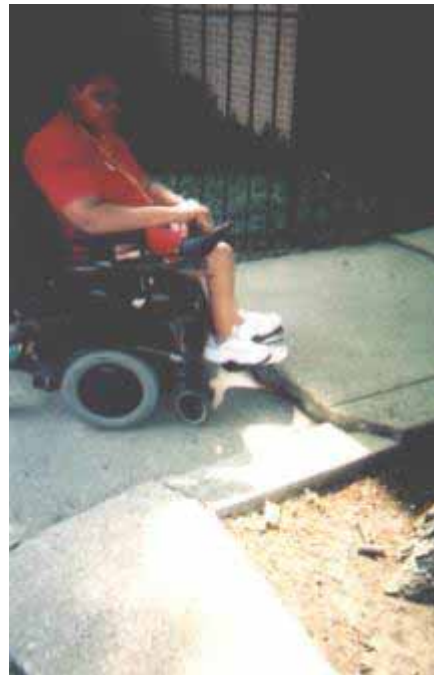
Alley crossing sidewalk near Harper/Blackstone