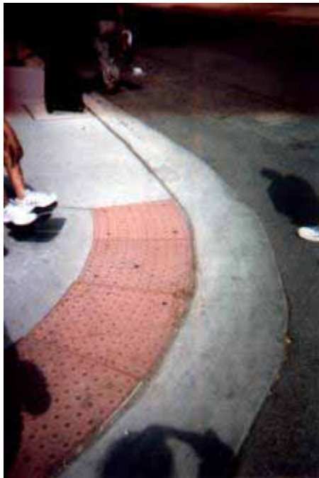
Intersection, 55th and Lake Park