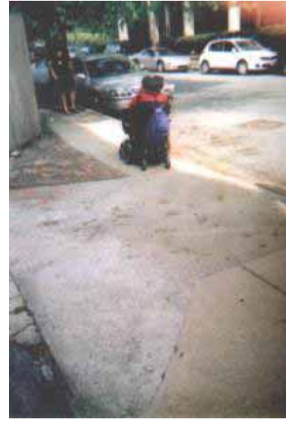
Closed-off driveway with bad slope, poor passage; rest of block is narrow with badly cracked sidewalk